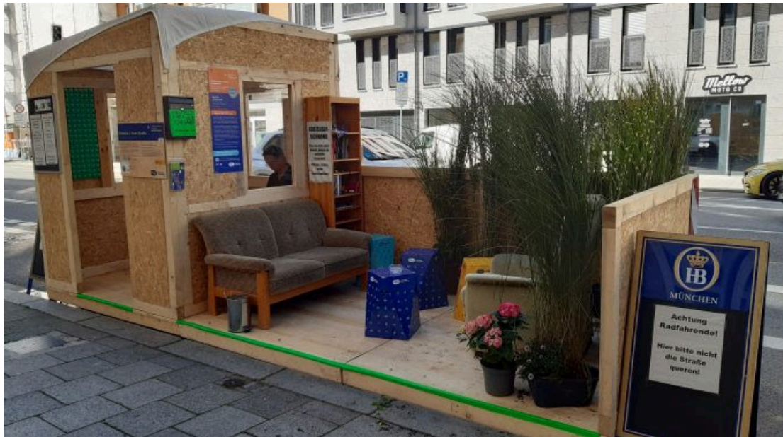
Photo of Open Mic studio at Schwanthalerstraße in Munich .

Climate change, a shift in mobility, air pollution, climate-impact adaptation and, last but not least, urban planning that focuses on people as people and not as car drivers - these are all important issues in major cities, not only in Europe.