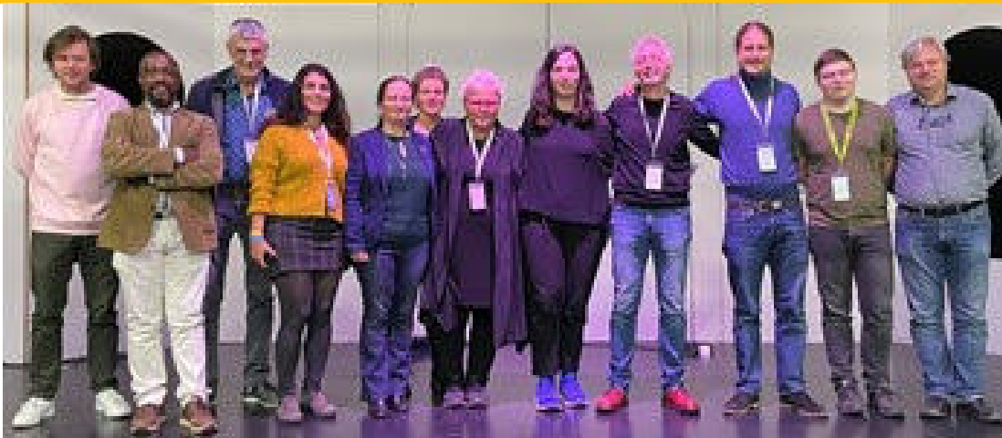
On-site presence during our GA in HAmBurg, October 30, 2021

Having celebrated our internal democracy in the CMFE through our annual General Assembly, CMFE now has a new, powerful board in place, counting 7 women and 5 men, representing 12 different nationalities, two new Europeans and securing a significant rejuvenation. The four of us leaving the board, trust that CMFE is now ready to continue to advance the urgent agendas confronting the world of community communication in Europe.